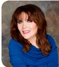
Musical Tribute by American Singer & Broadway Actress Maureen McGovern